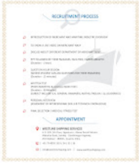
Recruitment Process.jpg 369K