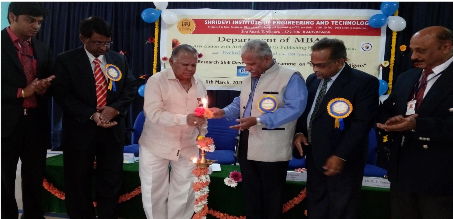
Inauguration of Research Paradigms