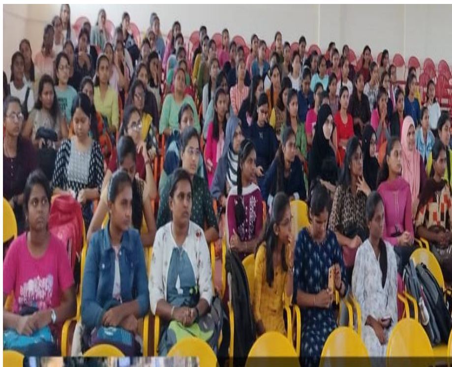
Awareness about Menstrual hygiene for girls students