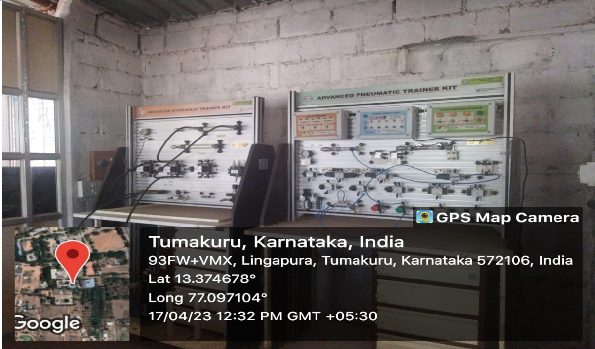
Mechanical Engineering Department-Hydraulic Machine Laboratory