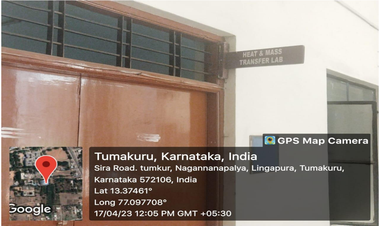
Mechanical Engineering Department-Heat and Mass Transfer Laboratory