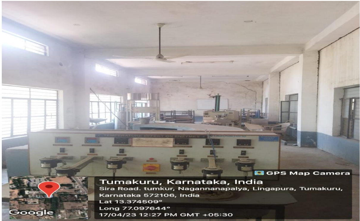
Mechanical Engineering Department-Foundry & Forging Laboratory