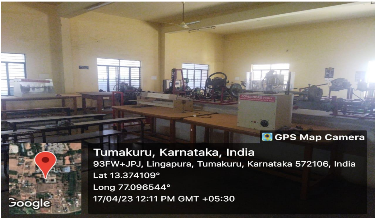
Mechanical Engineering Department-Design Laboratory