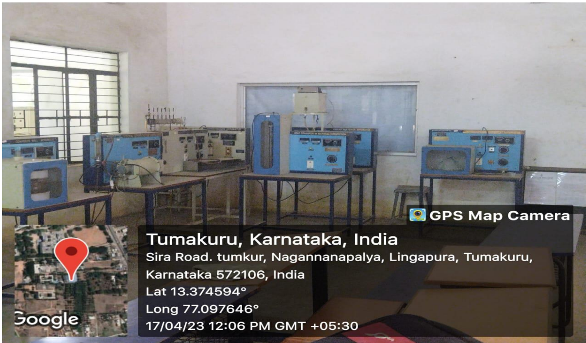
Mechanical Engineering Department-Heat and Mass Transfer Laboratory