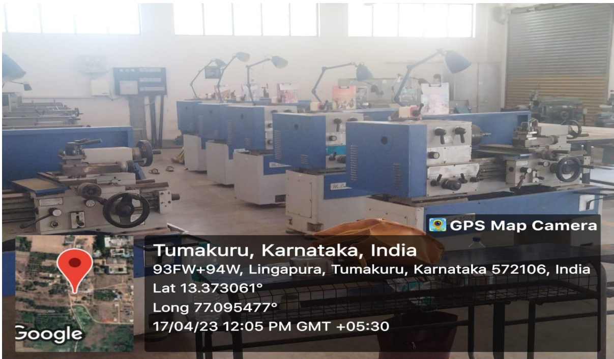
Mechanical Engineering Department-Machine Shop Laboratory