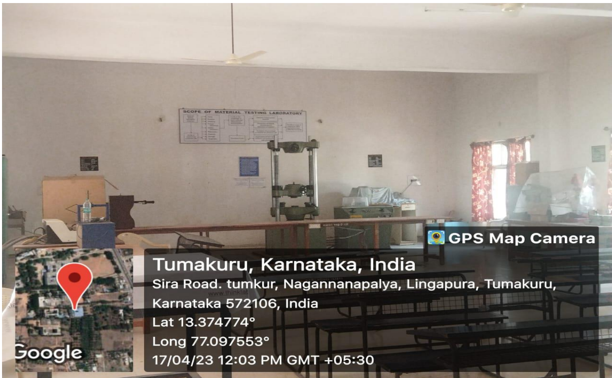
Mechanical Engineering Department-Material Testing Laboratory