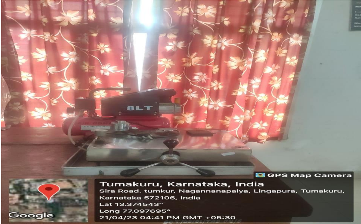
Mechanical Engineering Department -Measurement & Metrology Laboratory