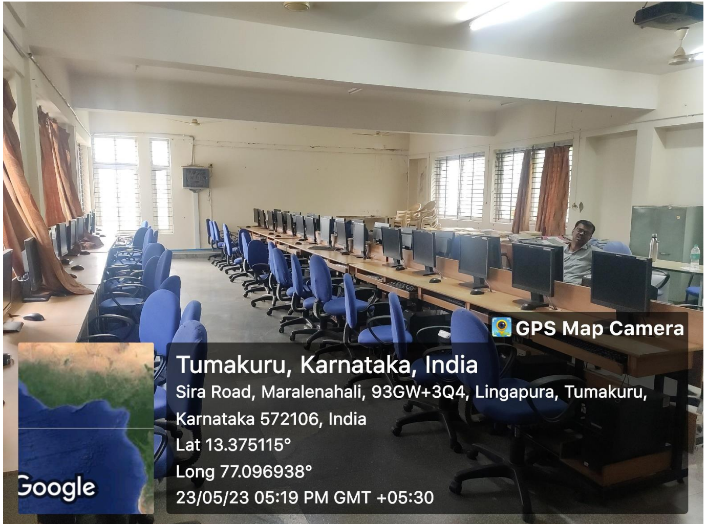
Mechanical Engineering Department-Robotics Laboratory- Inside View