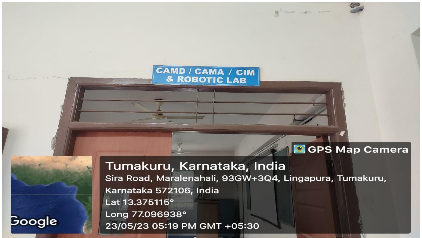
Mechanical Engineering Department-Robotics Laboratory