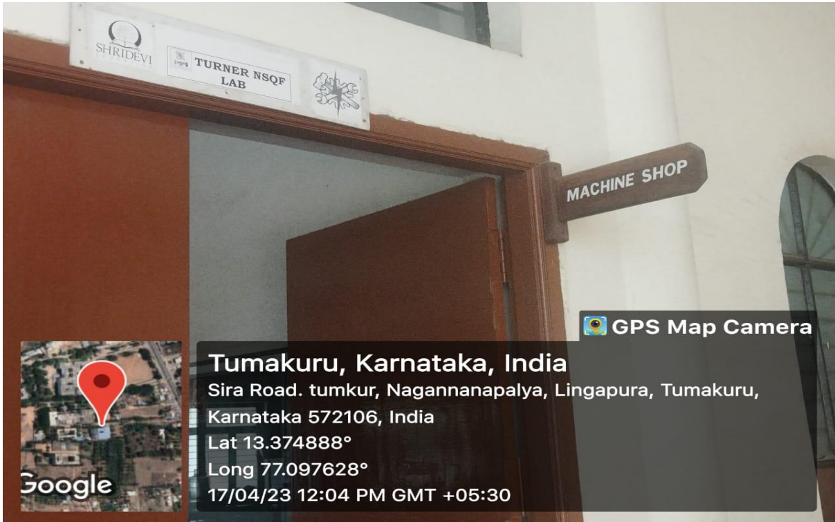
Mechanical Engineering Department-Machine Shop Laboratory