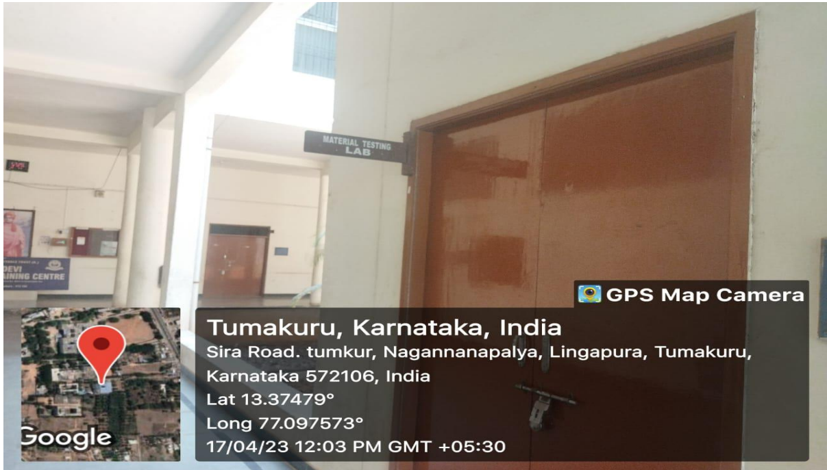
Mechanical Engineering Department-Material Testing Laboratory