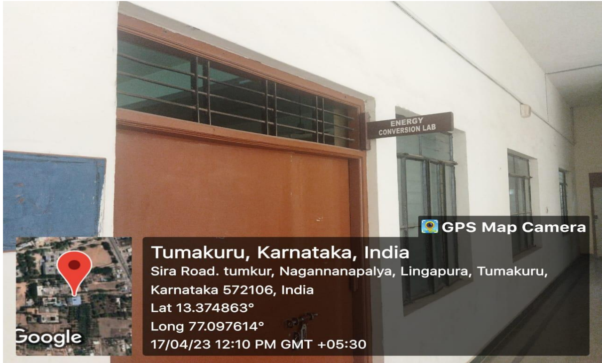
Mechanical Engineering Department-Energy Conversion Laboratory