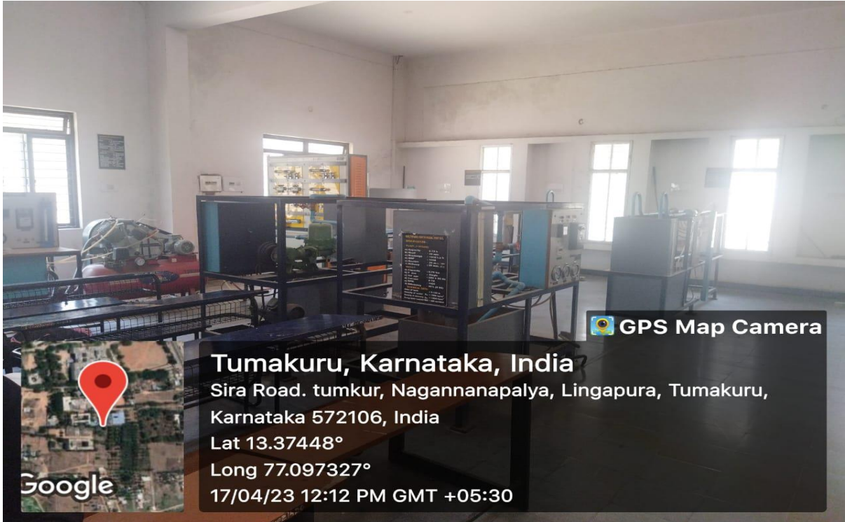
Mechanical Engineering Department- Fluid Machinery Laboratory