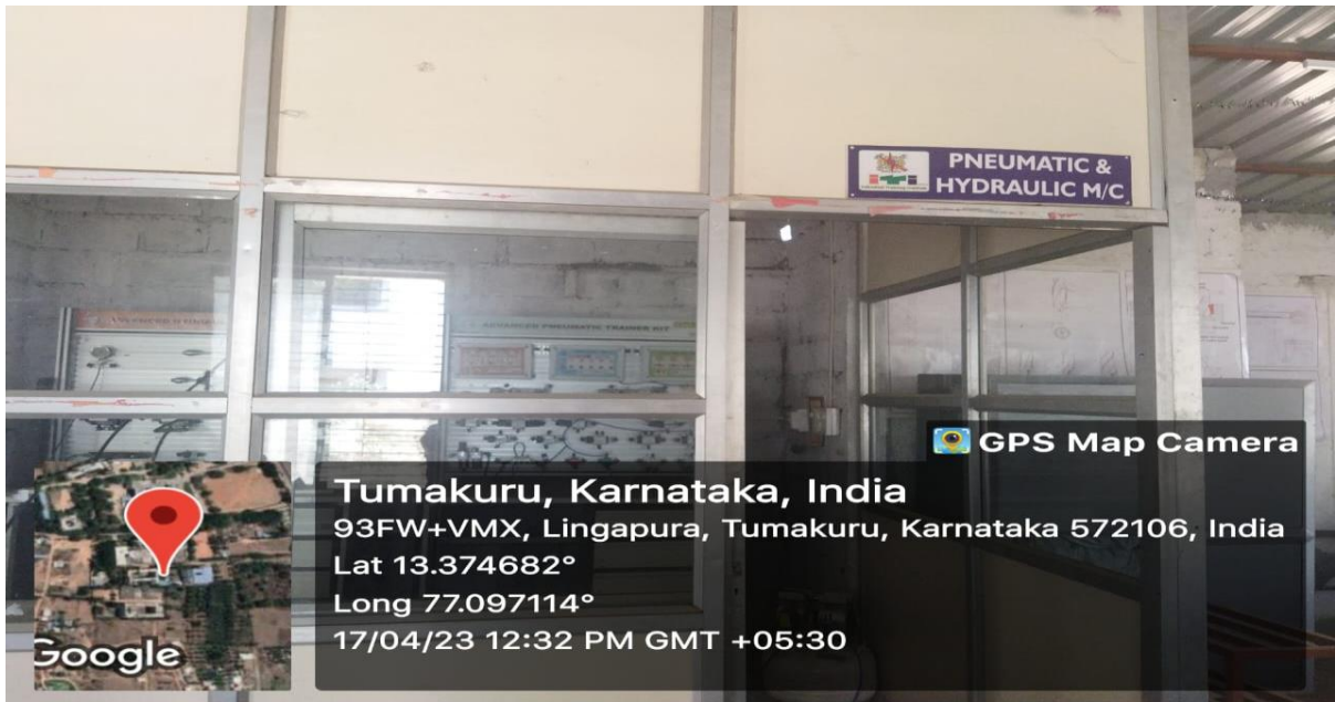
Mechanical Engineering Department-Hydraulic Machine Laboratory