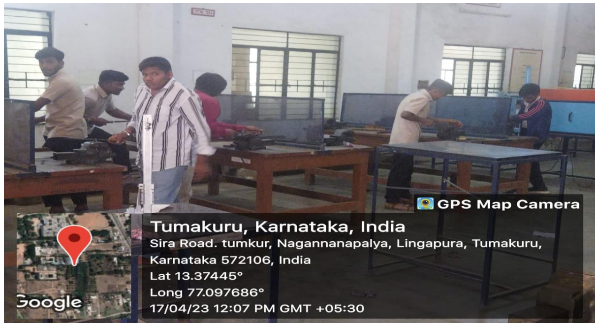
Mechanical Engineering Department-Basic Workshop Laboratory