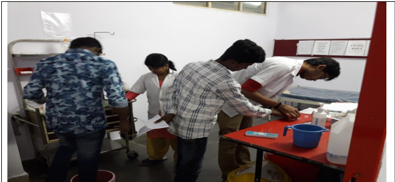
Tumkur District, Karnataka State