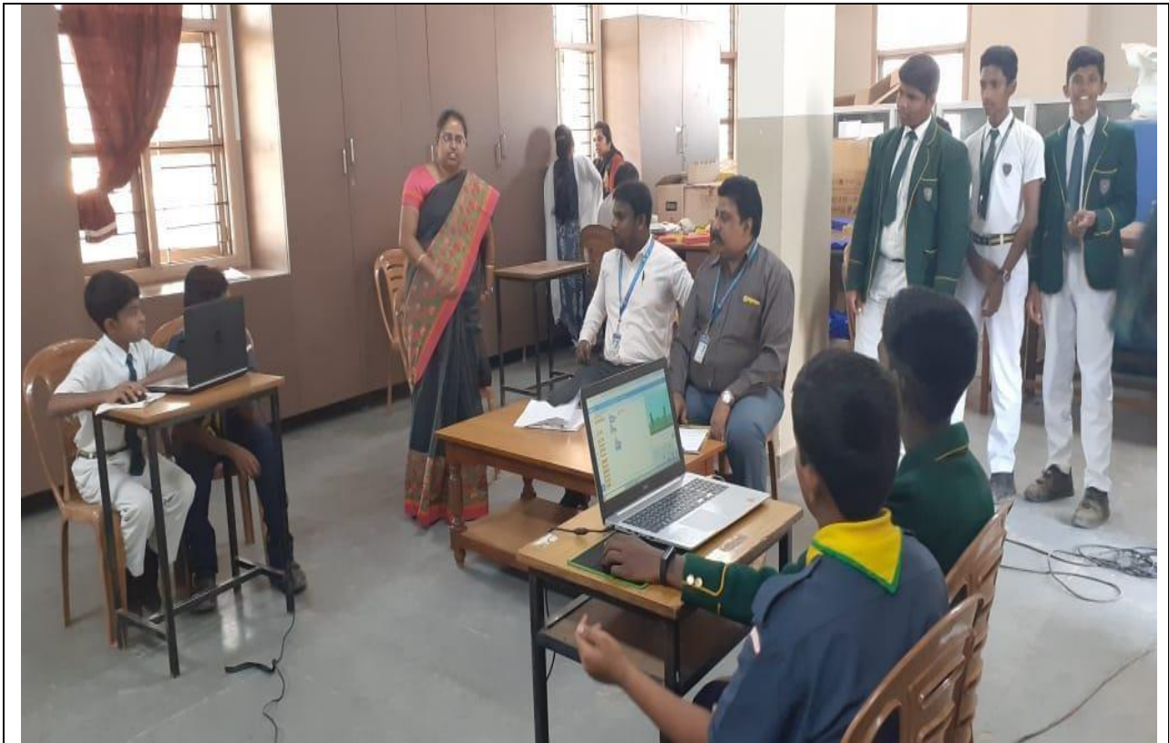
Photo: Bishop Sargant School, Tumkur District, Karnataka State