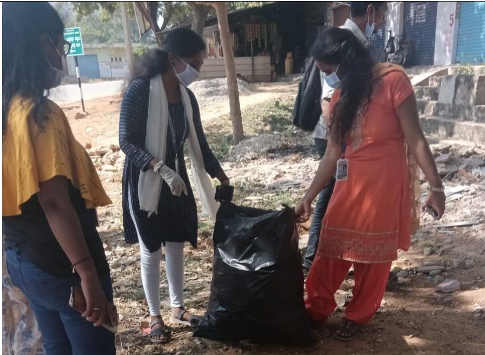
Photo: Plastic Campaign at Siddarabetta