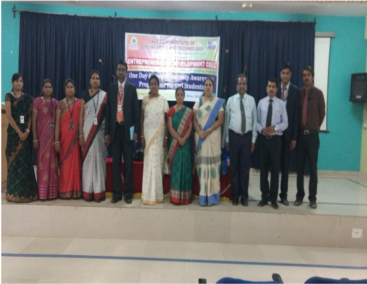
Entrepreneurship Workshop for Girls