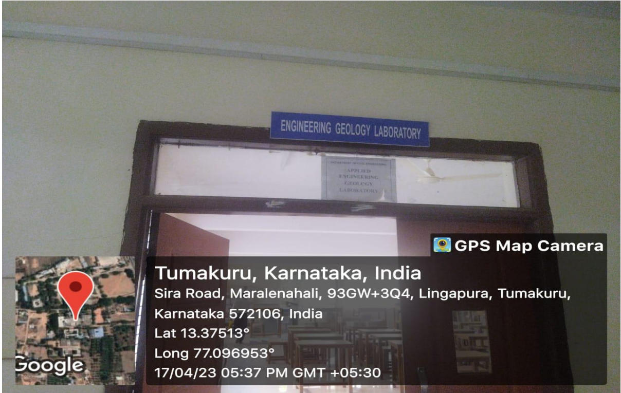
Civil Engineering Department- Engineering Geology Laboratory