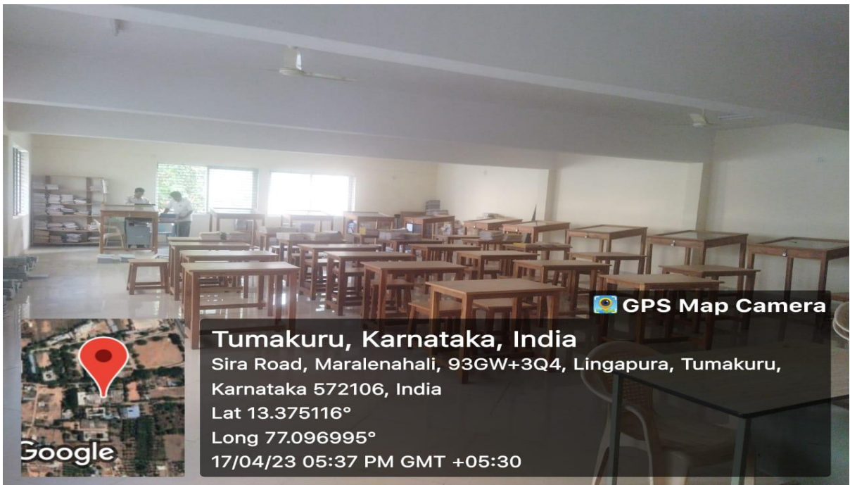
Civil Engineering Department- Engineering Geology Laboratory