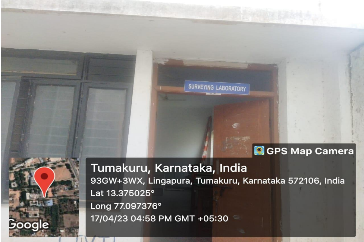
Civil Engineering Department- Surveying Laboratory