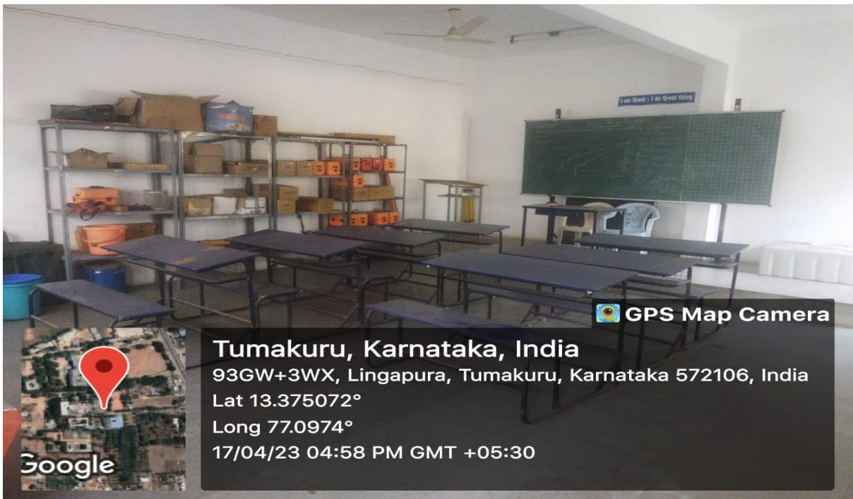
Civil Engineering Department- Surveying Laboratory