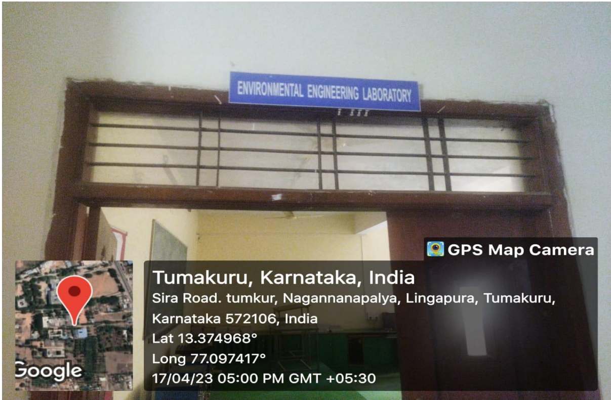
Civil Engineering Department - Environment Engineering Laboratory