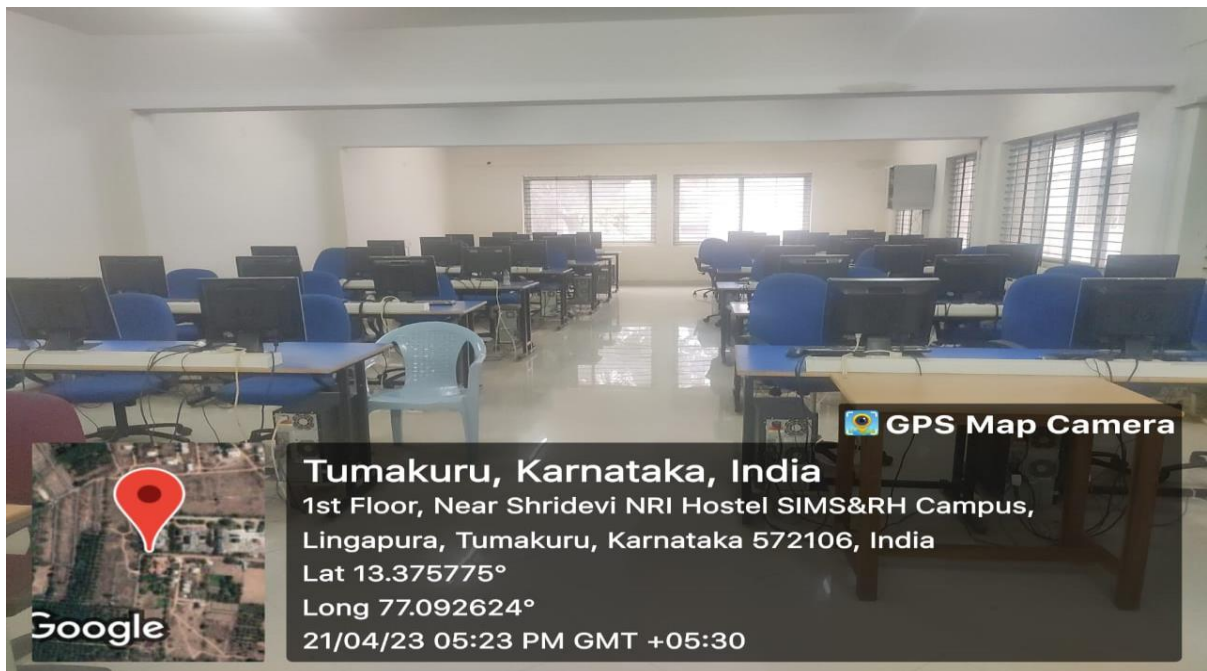
Civil Engineering Department- CAD Laboratory