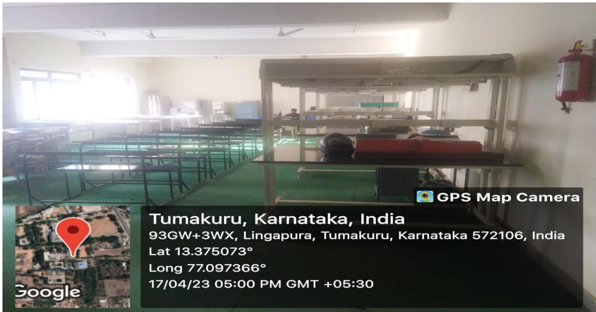
Civil Engineering Department -Environment Engineering Laboratory