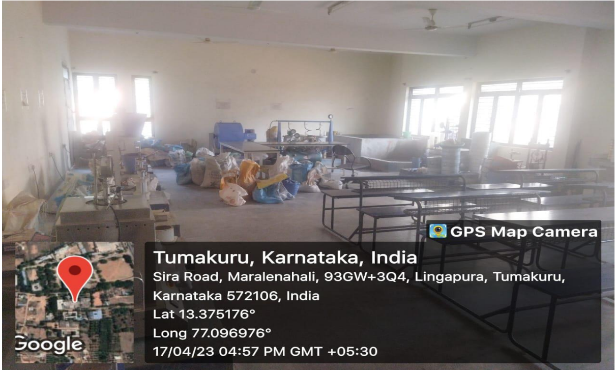
Civil Engineering Department-Highway & Concrete Laboratory