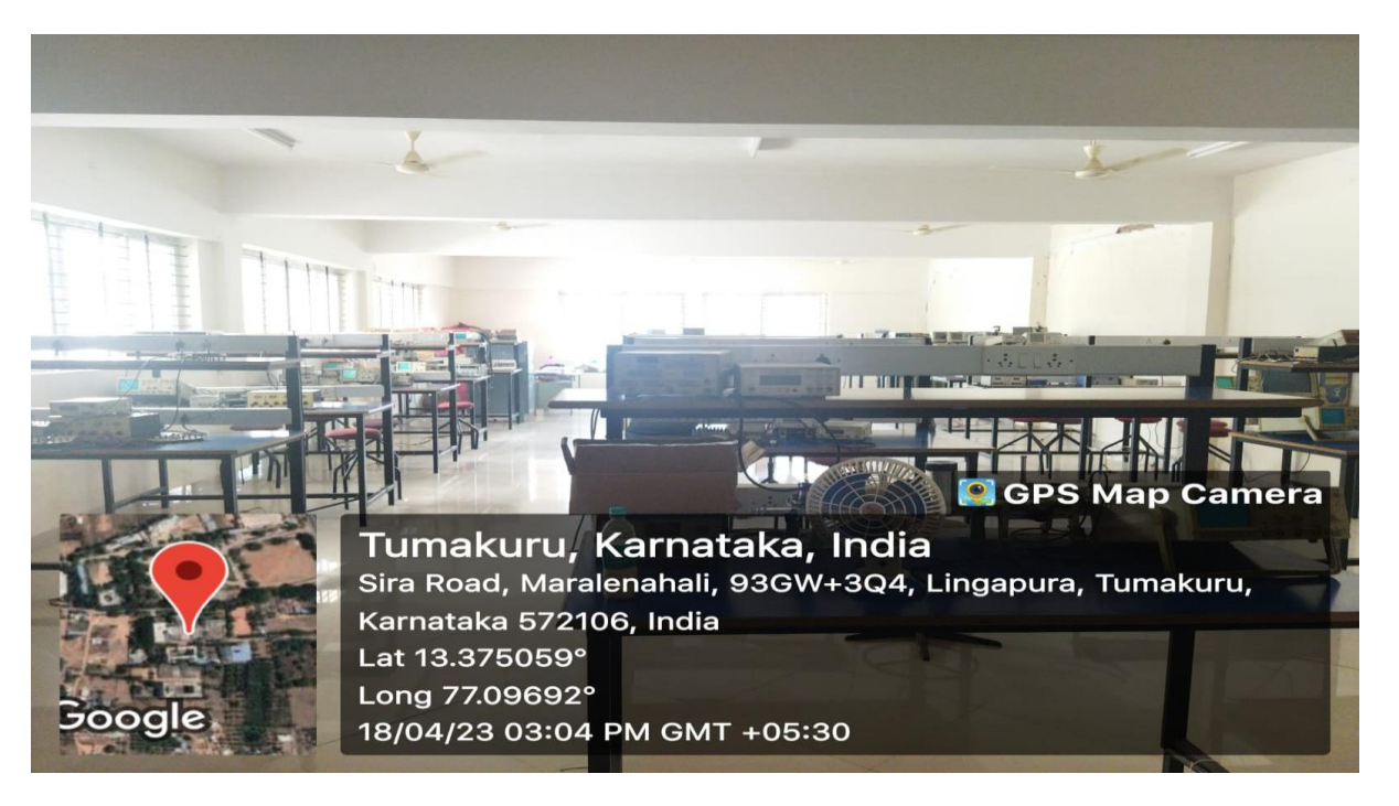
ECE Department- Communication and Circuits Laboratory

PRINCIPAL SHRIDEVI INSTITUTE OF ENGINEERING AND TECHNOLOGY