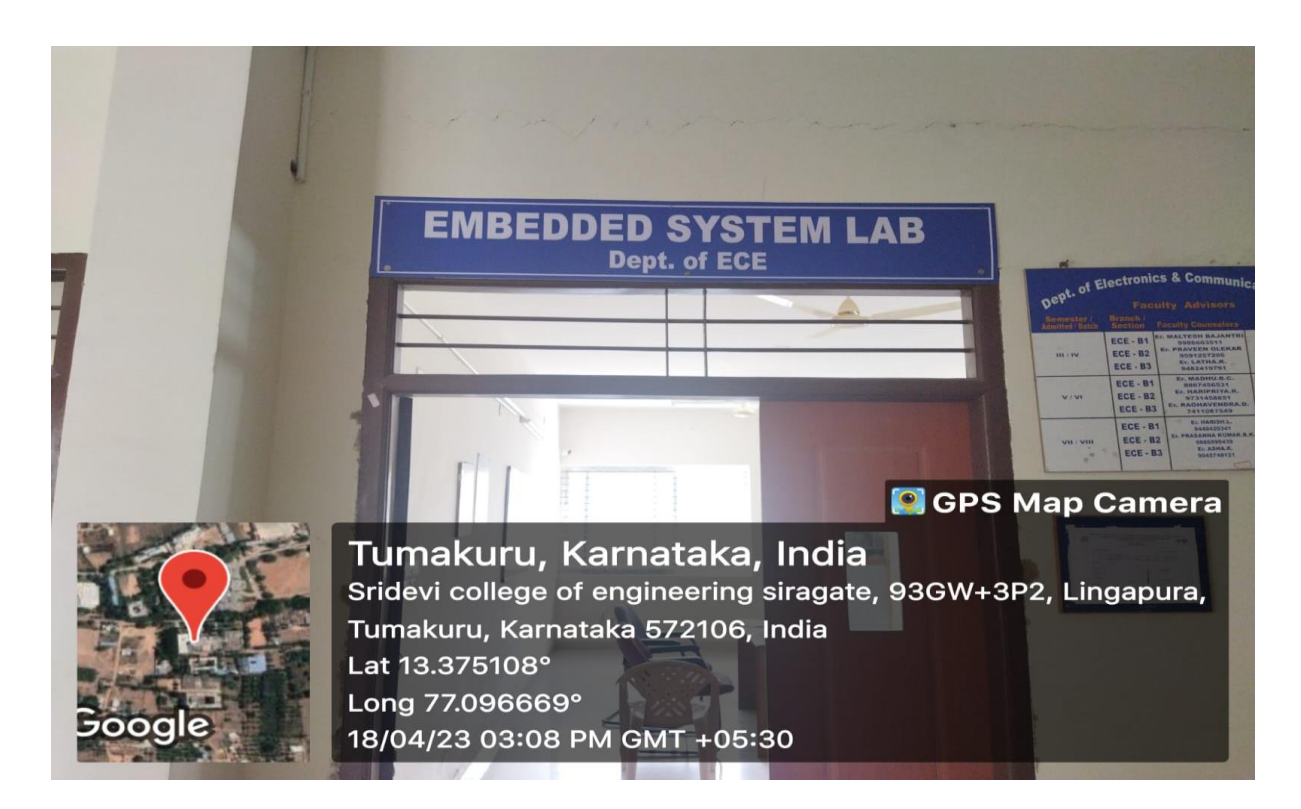
ECE Department-Embedded System Laboratory