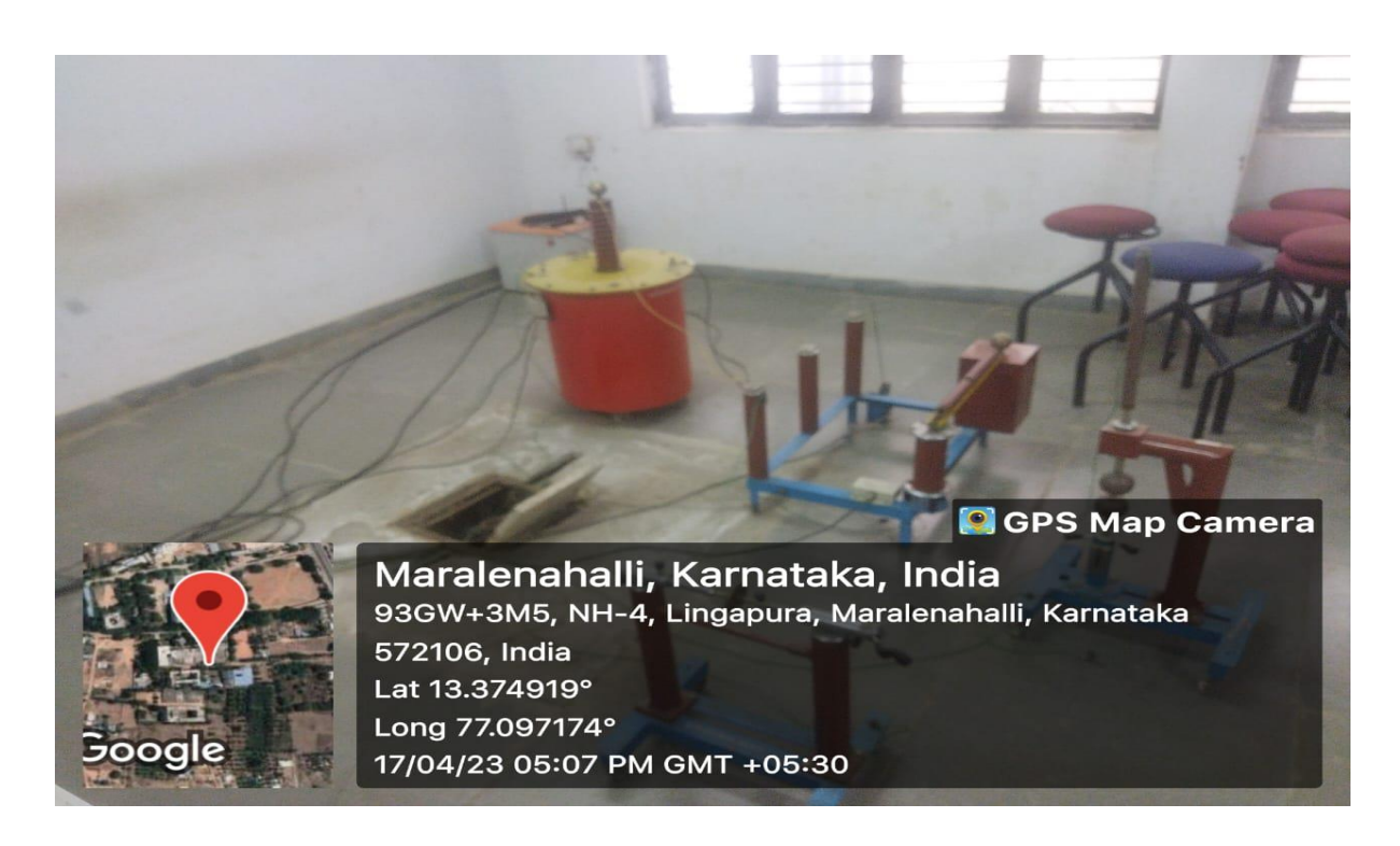
Electrical Engineering Department-Relay & H V Laboratory