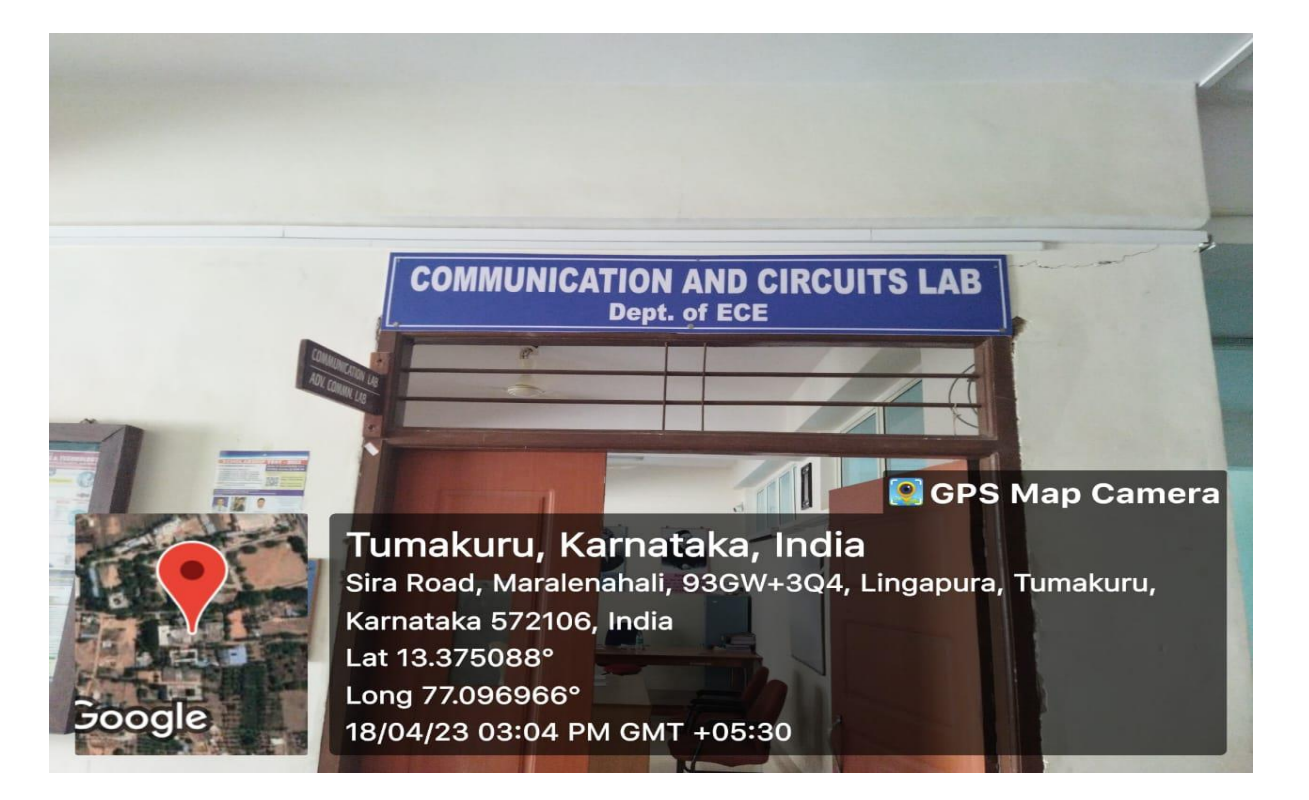
ECE Department- Communication and Circuits Laboratory