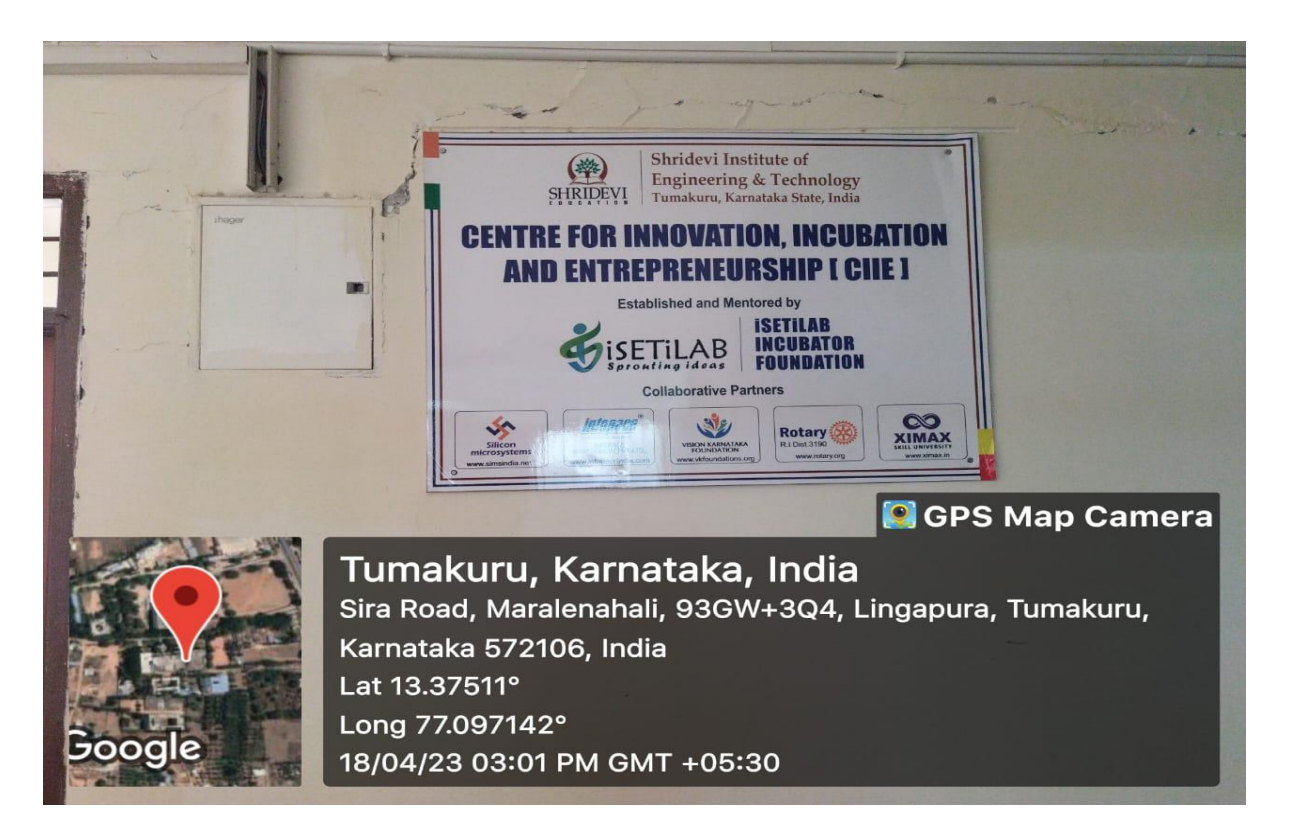
ECE Department- IOT Laboratory