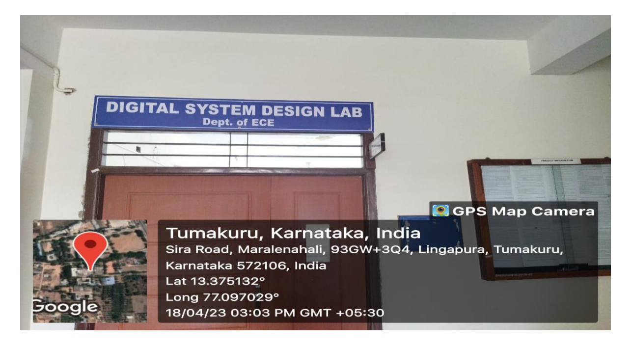
ECE Department-Digital System Design Laboratory