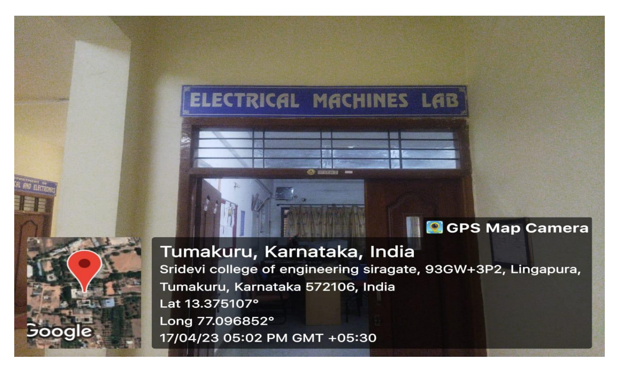
Electrical Engineering Department-Electrical Machines Laboratory

Email: info@shrideviengineering.org, principal@shrideviengineering.org | Website: www.shrideviengineering.org (Approved by AICTE, New Delhi, Recognised by Govt. of Karnataka and Affiliated to Visvesvaraya Technological University, Belagavi)