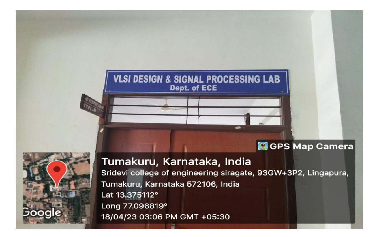
ECE Department-VLSI Design & Signal Processing Laboratory