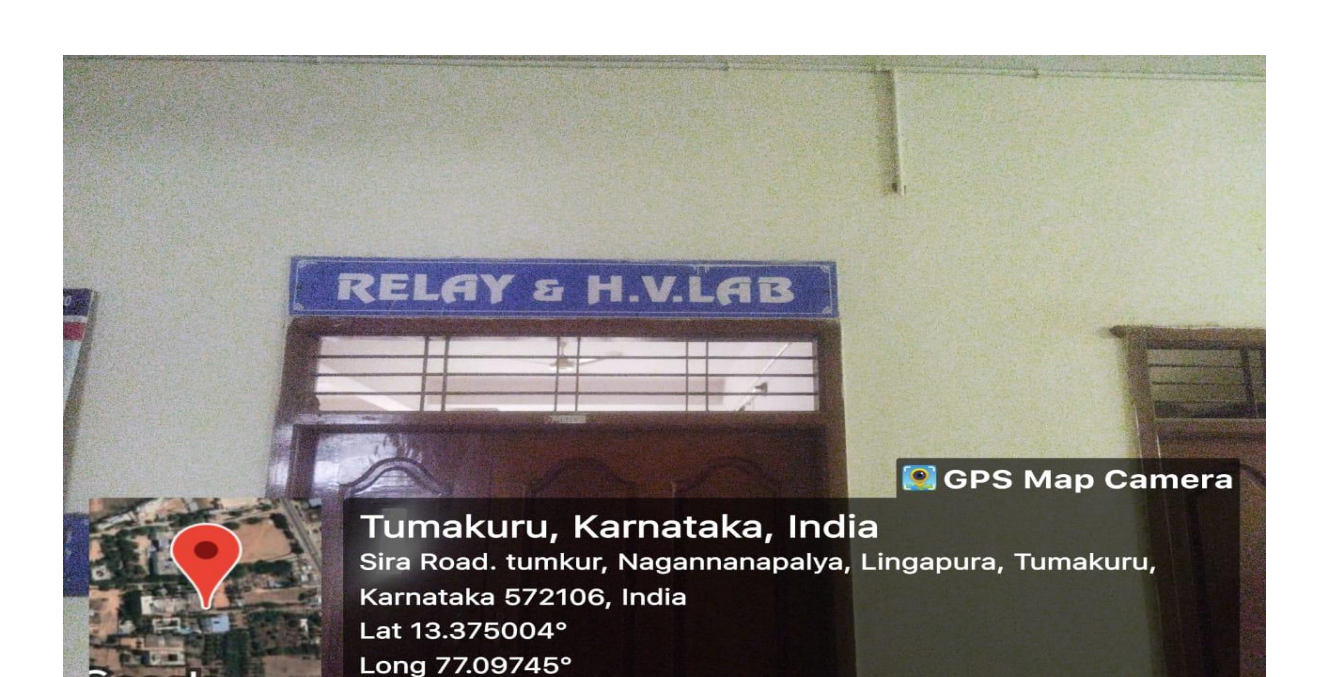
Electrical Engineering Department-Relay & H V Laboratory