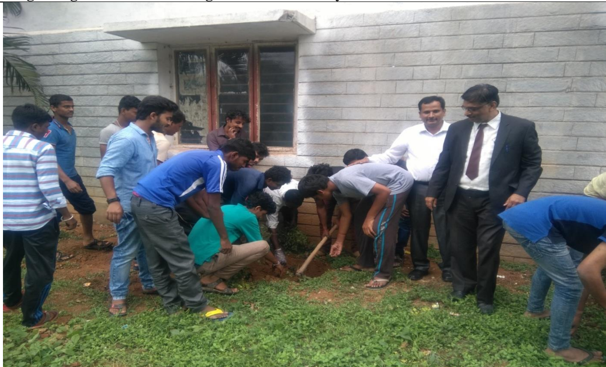
Photo: Clean Campus Day conducted in our campus