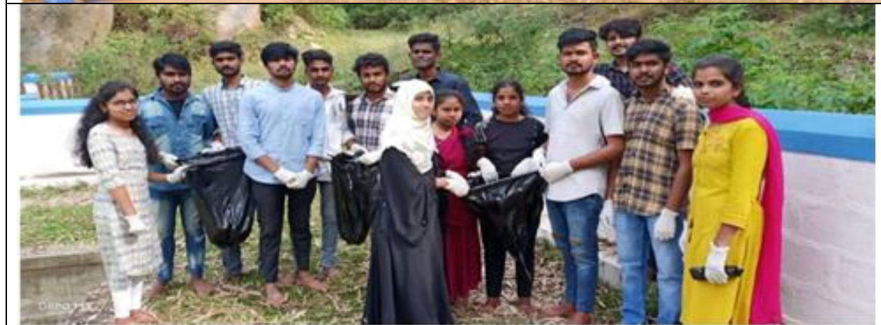
Photo: Student participating in Swatch Bharat Abhiyan Program at Devarayanadurga Hill Station, Tumkur District, Karnataka State