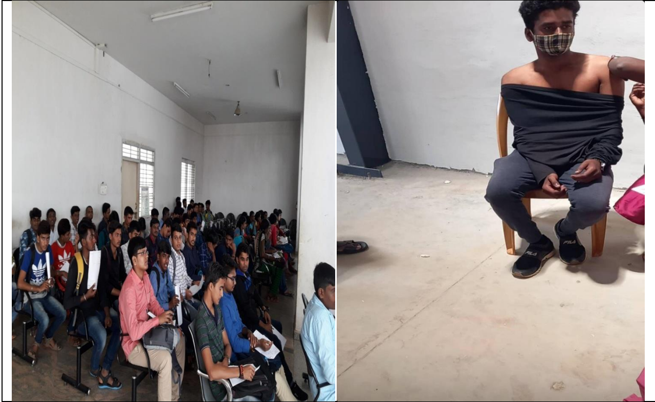
Photo: Our College Students participated in the Covid -19 Vaccination Drive , SIMS & RH,TUMKUR (D), KARNATAKA(S)