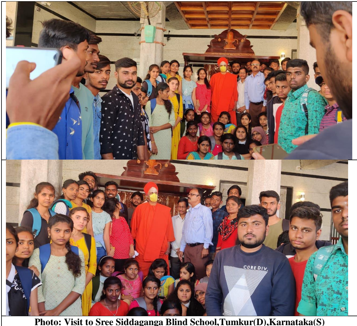
Photo: Visit to Sree Siddaganga Blind School, Tumkur(D), Karnataka(S)