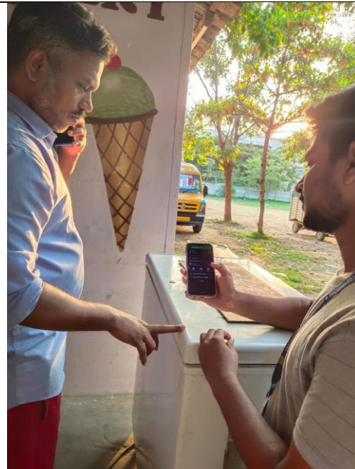
Photo: Giving awareness on Digital banking to the people of Guluru village , Tumkur District, Karnataka State