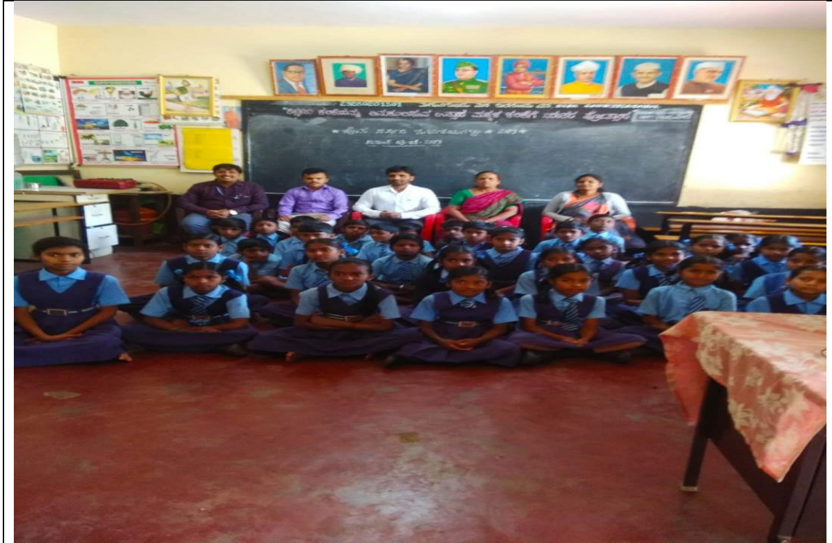
Photo: Awareness Program on Computer and Its Application for Government School Students , Oorukere