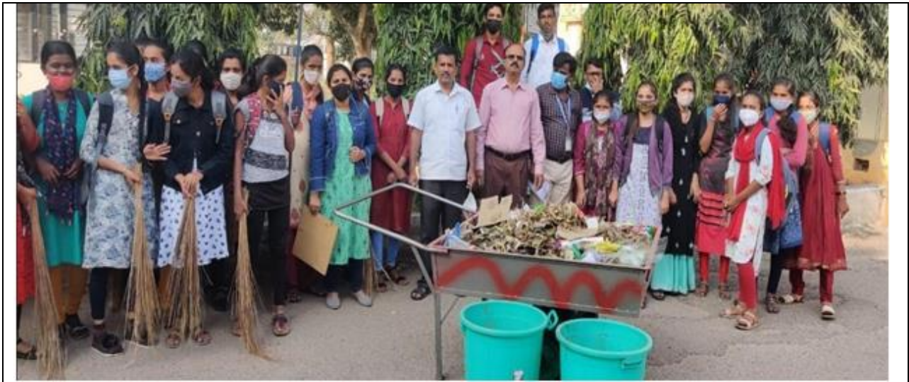
Photo: Primary health center, Saphagiri Ext. Tumkur (D), Karnataka (S)