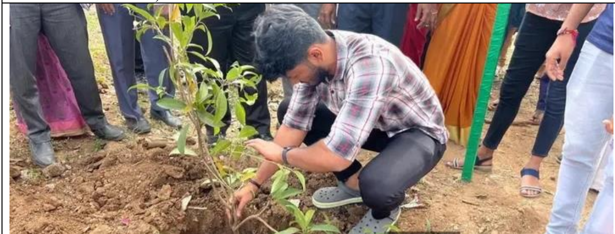
Photo: Tree Plantation by the students