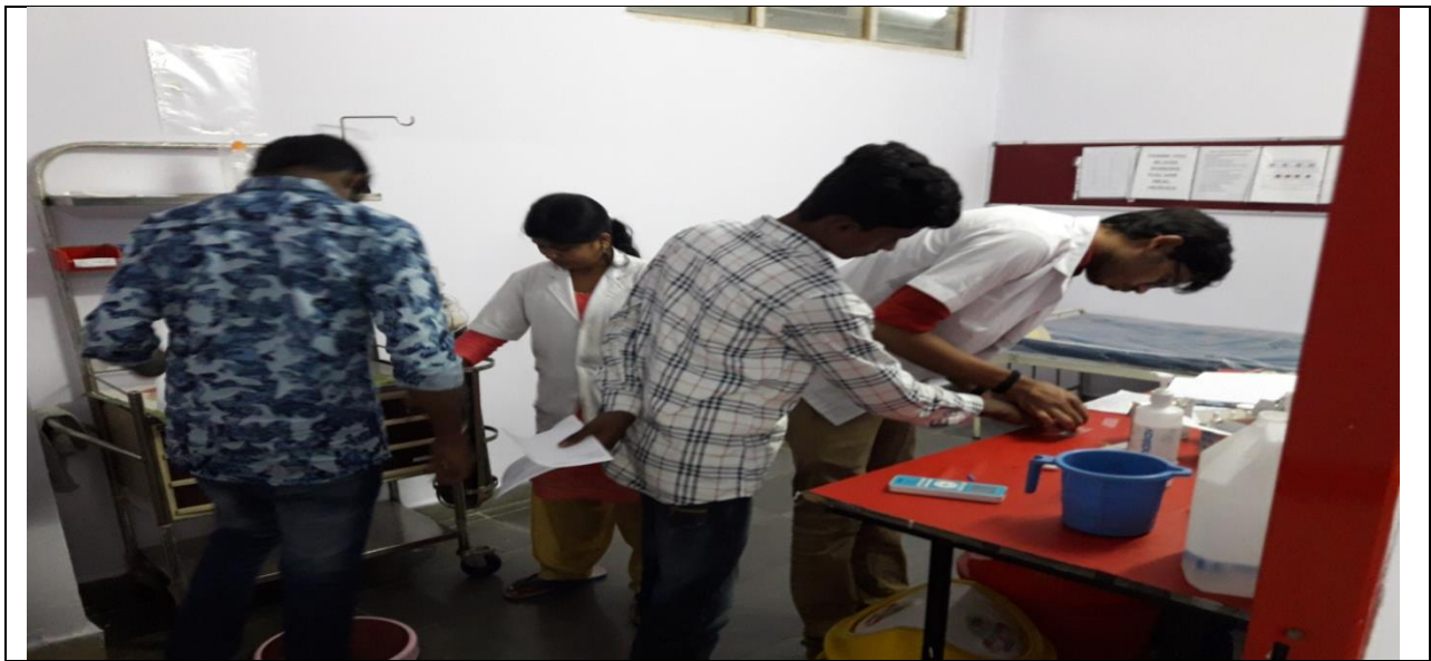
Photo: Primary Health Center, Tavarekere, Tumkur District, Karnataka State