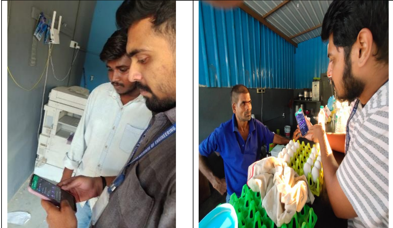
Photo: Giving Awareness on e-Ticket Reservation to the people of Oorkere Village, Tumkur District, Karnataka State