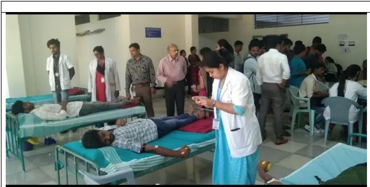
Photo: Blood Donation Camp in SIET campus