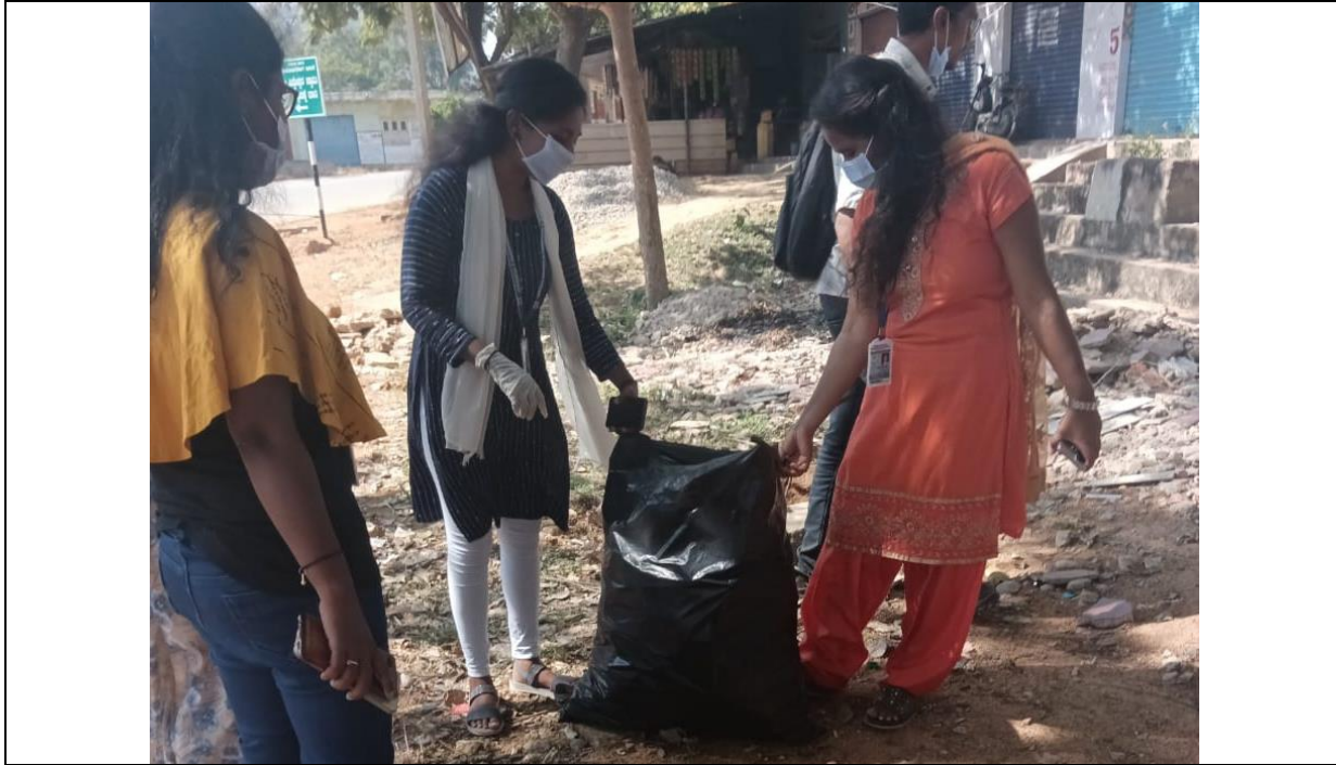
Photo: Plastic Campaign at Siddarabetta