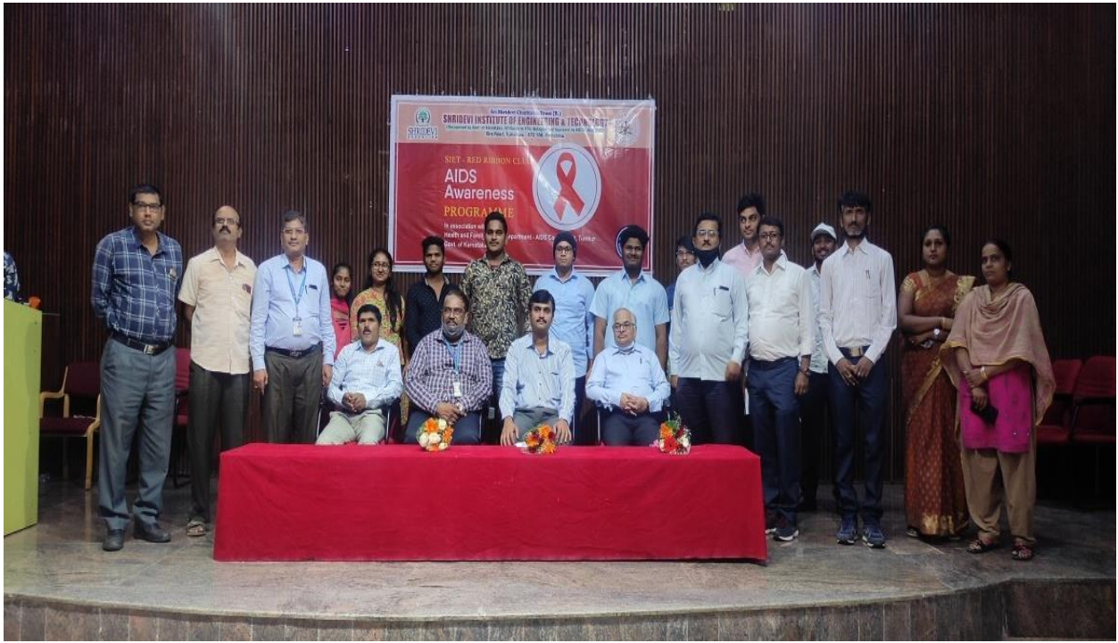
Aids Awareness Programme