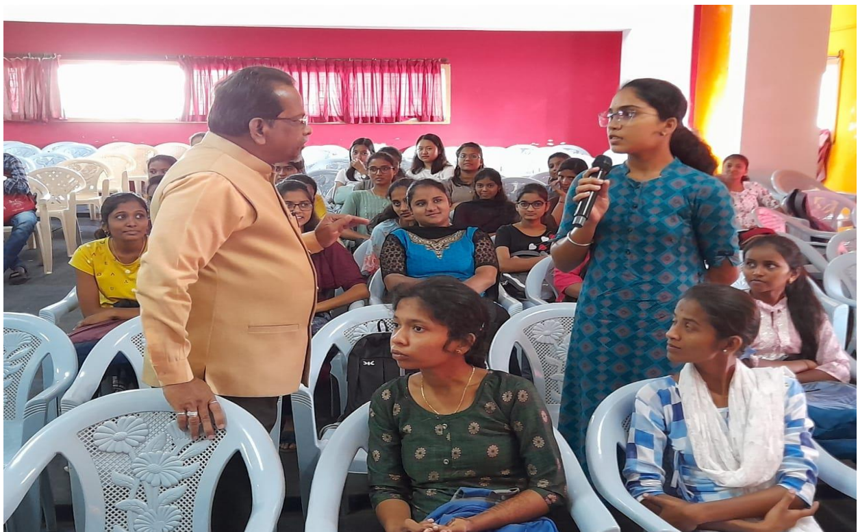
Interactions with students during the programme