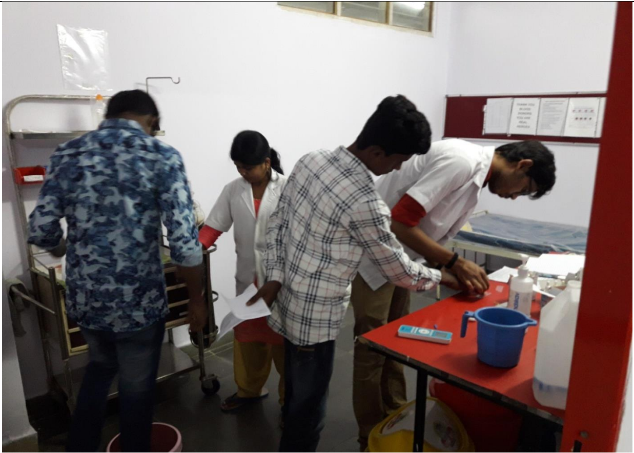
Checking the Blood Group