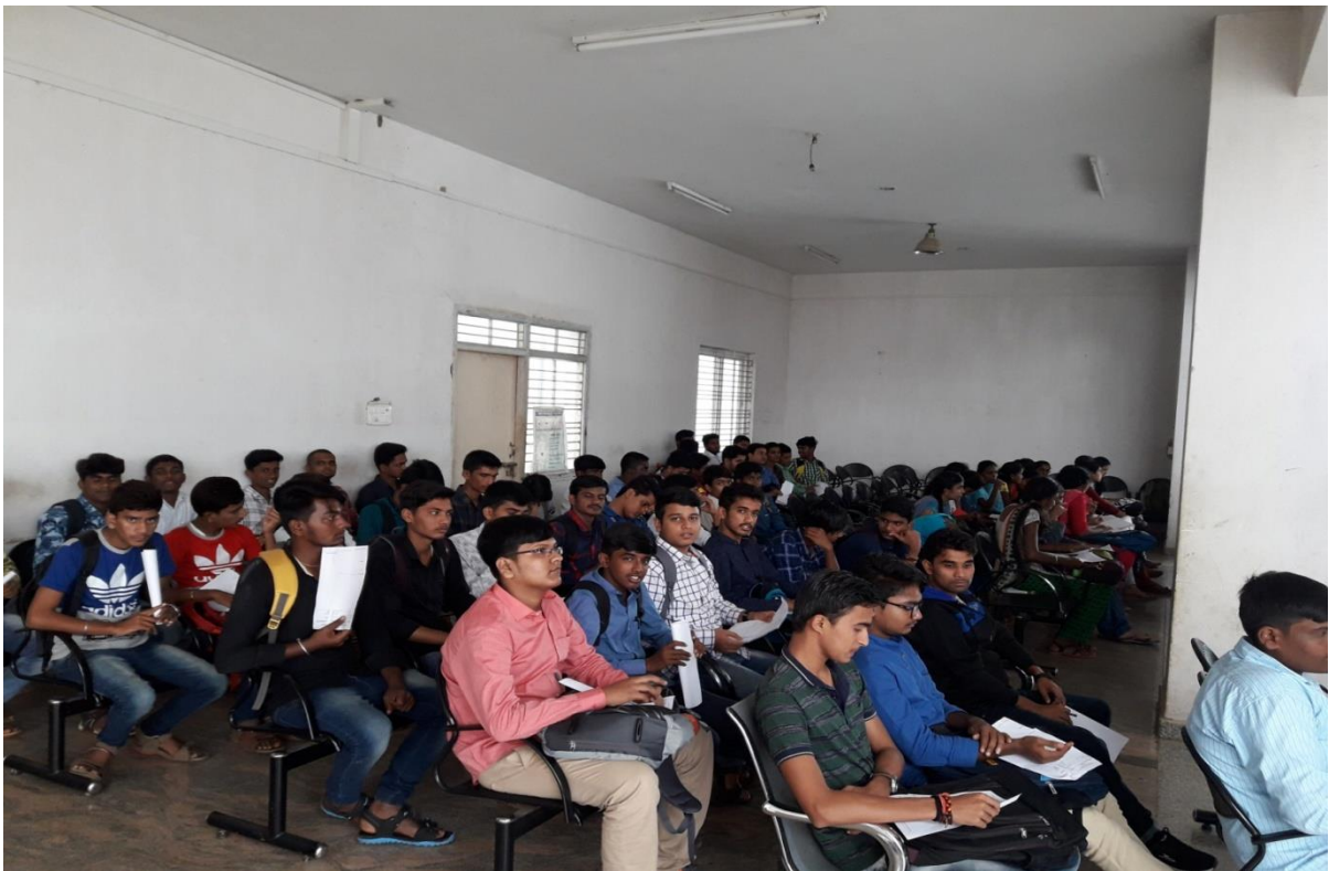
Orientation Program about Know your Blood Group