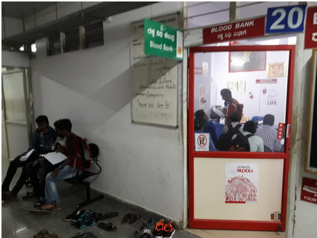
“Know Your Blood Group” Conducted by Santhosh T U