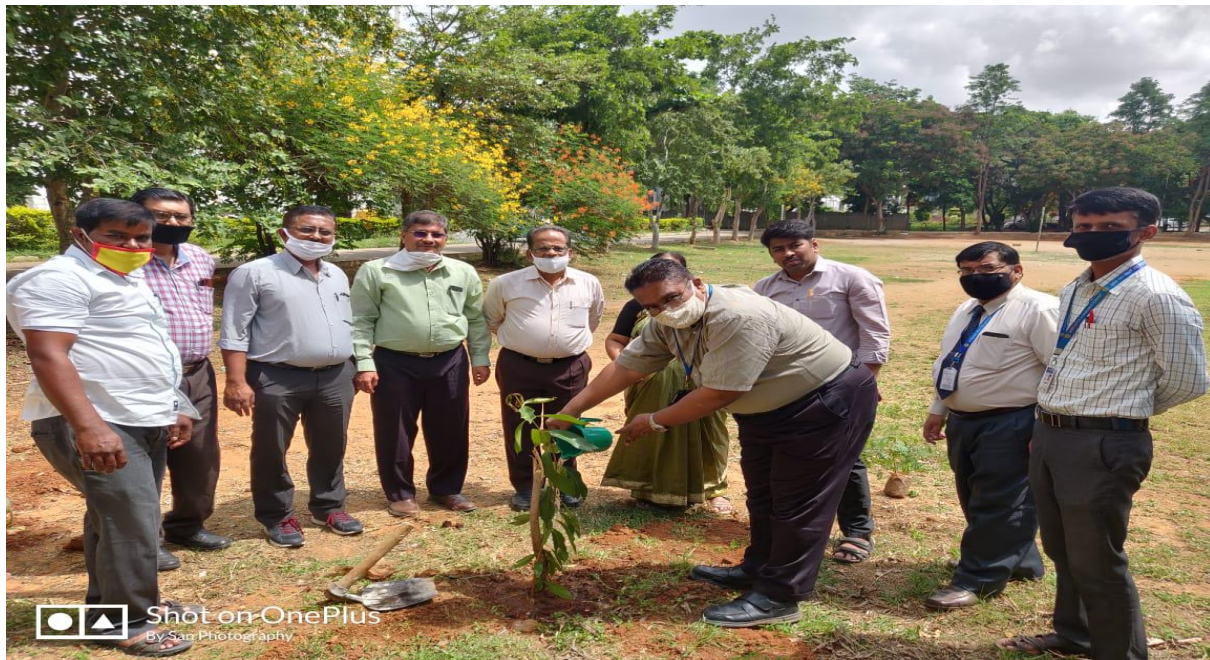
Planting a tree on “World Environment Day” By Principal and staff members Of SIET