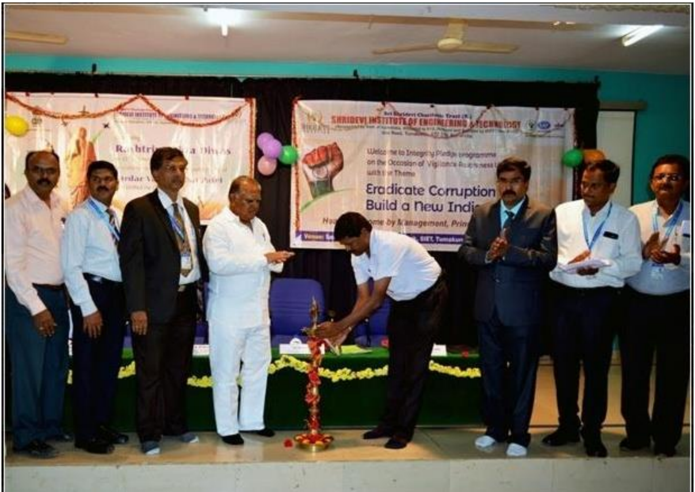
Lamp Lighting ceremony during the Program on Eradication of Corruption and Build new India