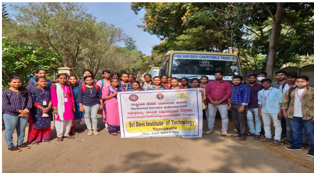
Swachh Bharat Abhiyan program at Namada Chilume