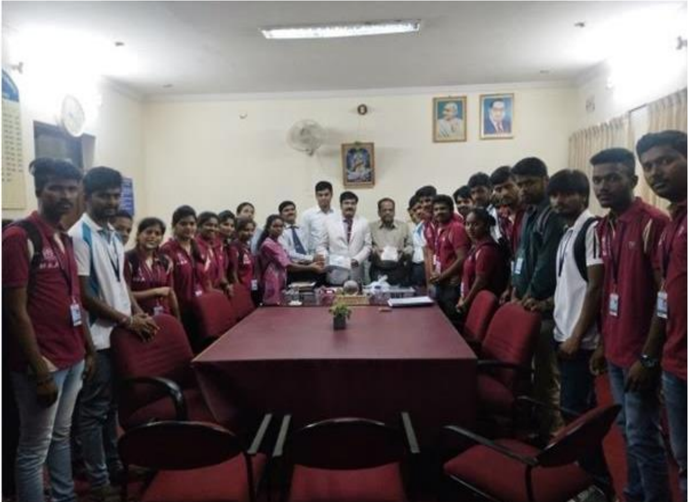
Students of Shridevi Institute Of Engineering and Technology collected fund for the Kodagu disaster and the fund was donated to the Red cross for the construction of houses to the poor people in Kodagu.