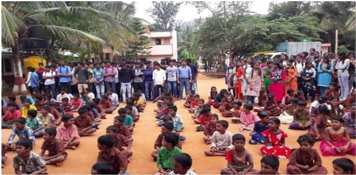
First year students were taken to the Child Orphanage home at Mydala and students were gifted Books, Pens, Fruits and snacks during the visit