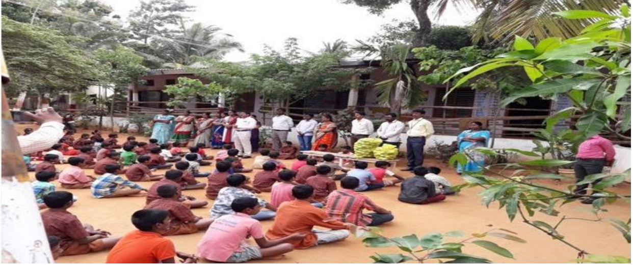
A glimpse of visit to orphanage at Mydala.