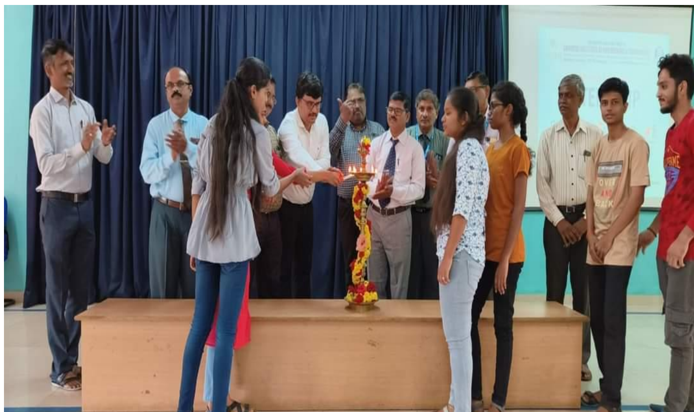
Lamp Lighting Ceremony during Industry 4.0